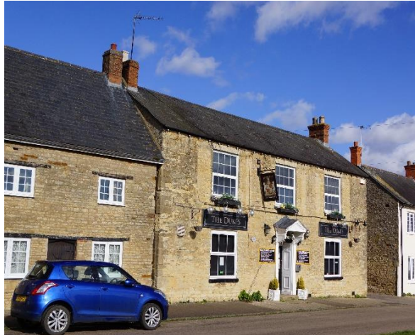
The Duke's Arms, Woodford

We are invited to visit Manor Close Residential Home, Thrapston for a Summer evening ride in to display our bikes to the residents.