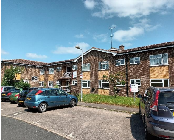
Manor Close Residential Home

A RIDE OUT TO MANOR CLOSE THRAPSTON = WEDNESDAY 12 TH JULY 2023