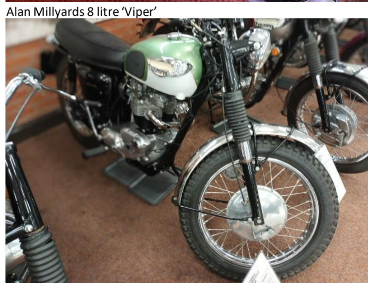
Trophy TR6C from 1967 popular at home and in the USA