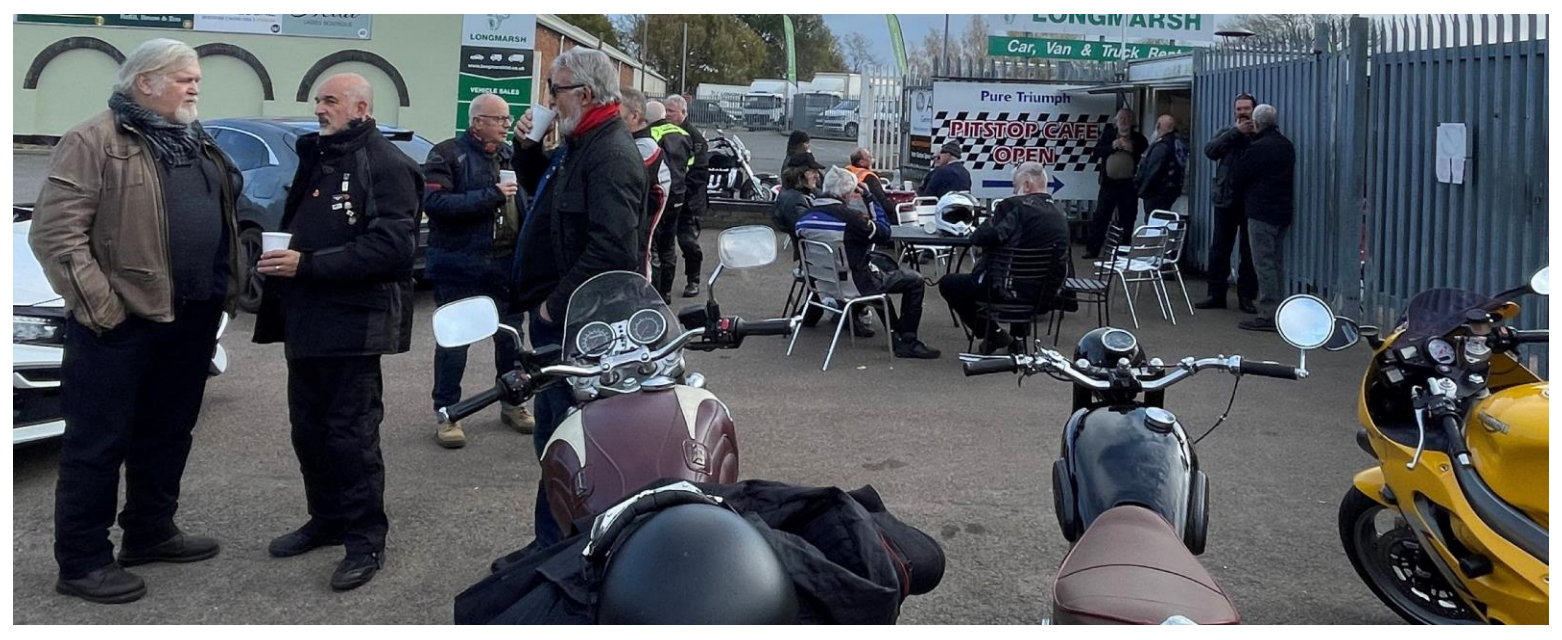
It was a nice excuse to try a few more Triumph bikes out for size, decision made, the Tiger it is!