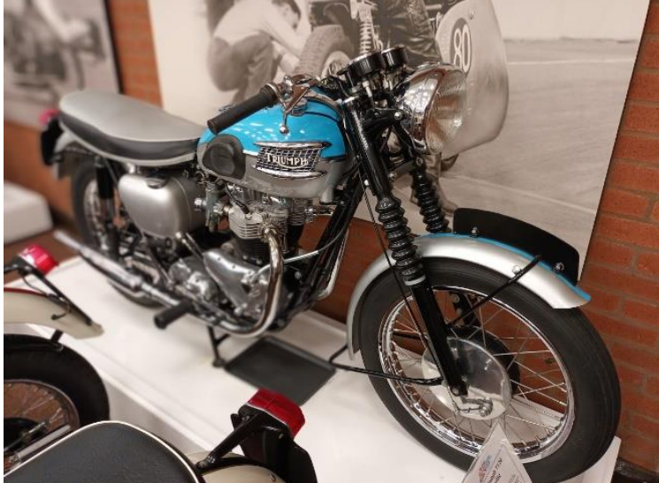
Slightly refined edition from 1961