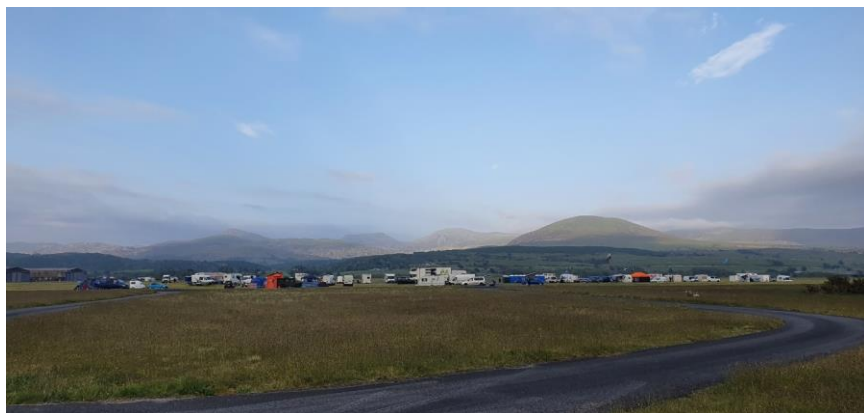
FIGURE 1: BASE CAMP AT LLANBEDR. WHAT A VIEW

I had entered both the ‘No Mercy’ winner takes all drag race and the half mile top speed sprint. I figured that as I was hitting 136mph at the end of the quarter, I should be somewhere near my bike’s top speed at the half mile marker.