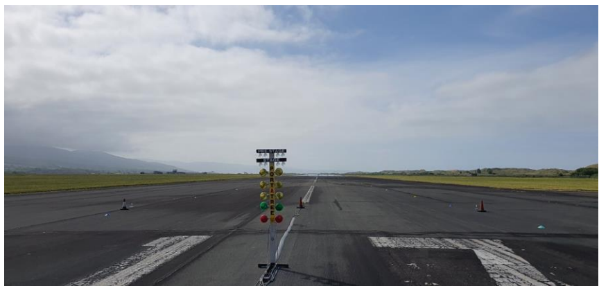
FIGURE 2: VIEW FROM THE START LINE

The first exit back to the pit area is on the right at the half mile mark, so if you are completing the half mile sprint or miss the turn after your quarter mile run, it’s another mile to the end of the runway and the service road back.