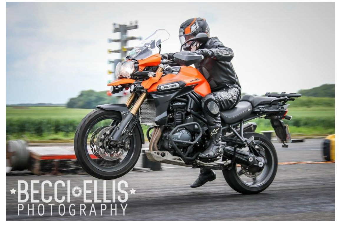
So much for anti-wheelie technology....

Round 6. Lancaster Raceway, East Kirkby. The Tiger likes it here and was immediately running in the 11.2s again. And then it happened. 11.12 @ 121 mph. Followed by an 11.17 with a bit of pedalling at the top just in case. Then at last, the elusive race win after running the final twice due to faulty lights the first time.