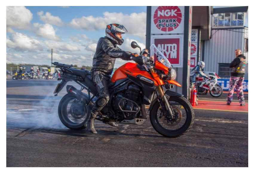
So how do I switch the traction control off? Sorted!