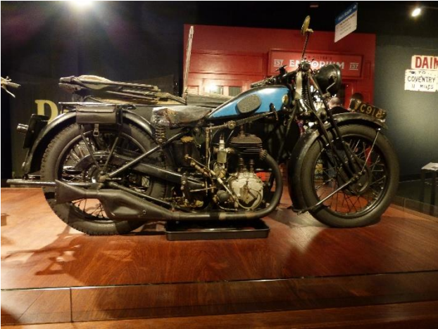
1929 Sidevalve single. Model unknown