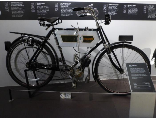
"No.1" The oldest known Triumph from 1902