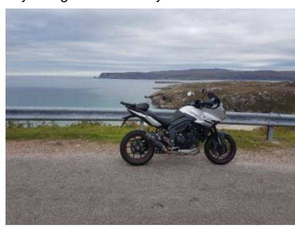
Tiger @ Durness

Awoke to yet another nice day. After breakfast my plan was to ride to Durness 65 miles from Ullapool on my favourite UK road, then went across to Tongue before it was time to head back. Once you are this far north there are very few roads that I haven't been down previously but I managed to find a single track road back to Ullapool. 45 miles into my 85 mile journey I experienced the first rain of my trip. I stopped at a little village called Lairds to put on my waterproofs then rode to Ullapool arriving at 5pm. I left at 6 for my long walk into town for dinner and beers. Sadly the only thing to be gleaned from this trip is biking heaven, but I already knew this, BUT what a waste if time and money, another day riding around on my own.